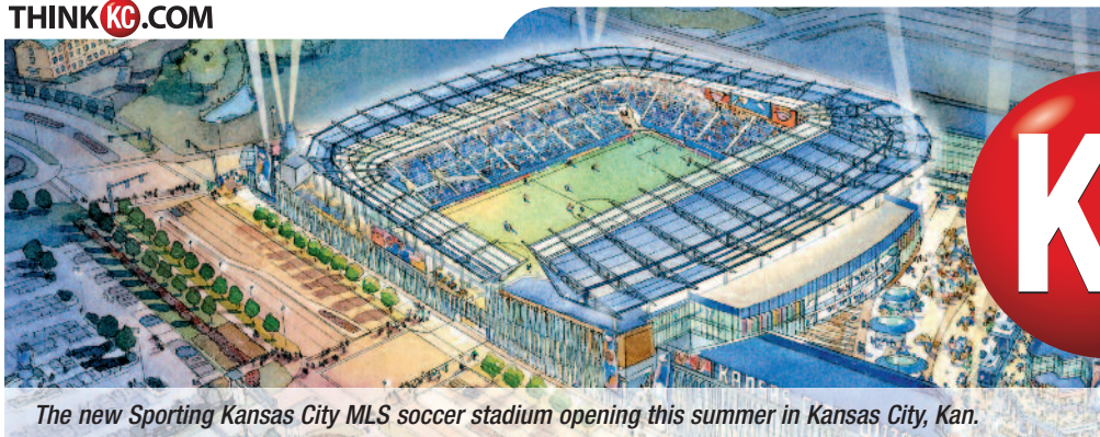
The new Sporting Kansas City MLS soccer stadium opening this summer in Kansas City, Kan.