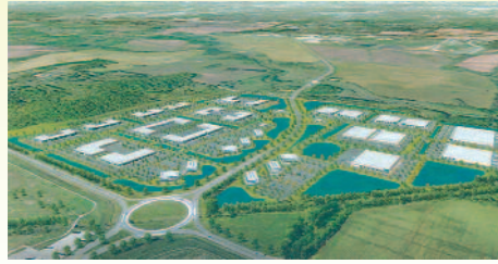
Site of the Independence Business Park

Community of Christ Church to build a 360-acre business park which will be home to future